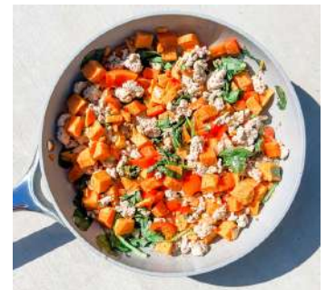
Ground Turkey Skillet

Chopped broccoli, red onion, unsweetened dried cranberries, sliced almonds, avocado oil mayo, salt, and pepper, topped with smoked salmon.