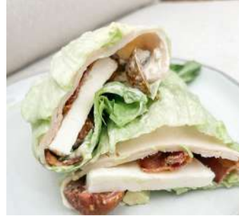
Turkey Lettuce Wraps

Canned tuna with olive oil, sea salt, and dill over mixed greens, avocado, red onion, cherry tomatoes, and cucumber.