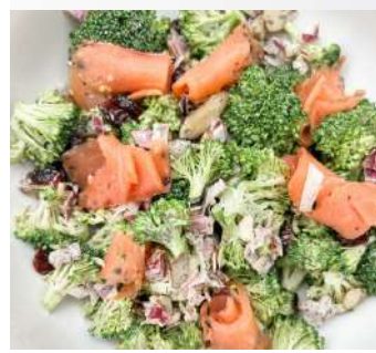
Smoked Salmon and Broccoli Salad

Greek yogurt topped with mixed berries and sunflower seeds.