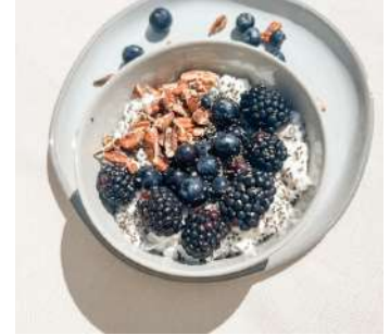
Cottage cheese with mixed berries

Organic sliced turkey, mozzarella, tomato, red onion, and avocado in a lettuce wrap.